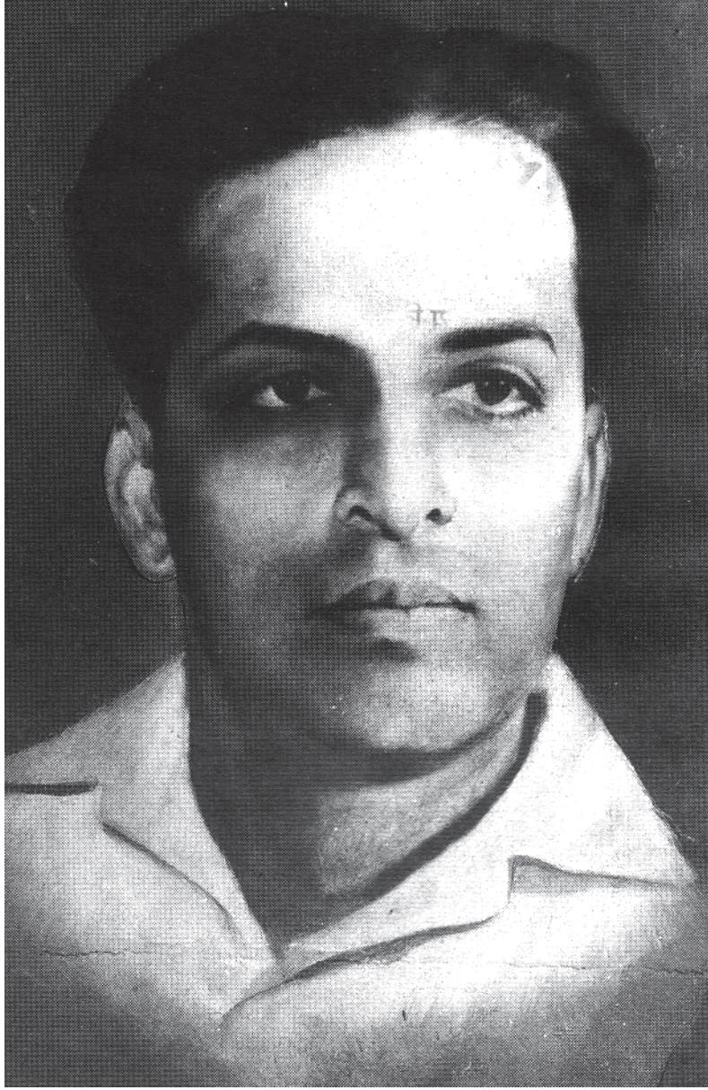
हुतात्मा नारायण द. आपटे